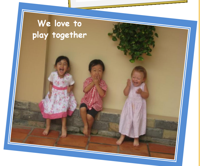
We love to play together